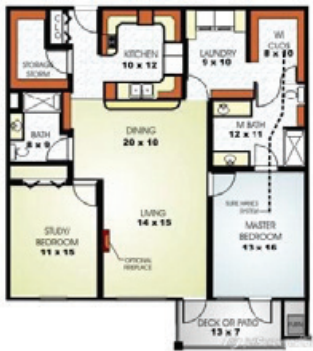
2 Bed ■ 2 Bath 1440 Square Feet